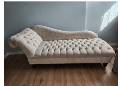
This beautiful piece of furniture is up for grabs to the highest bidder due to a lack of storage space in the Studio Stage Door.

Send your offering to crancommtheatre@gmail.com by Saturday April 10th